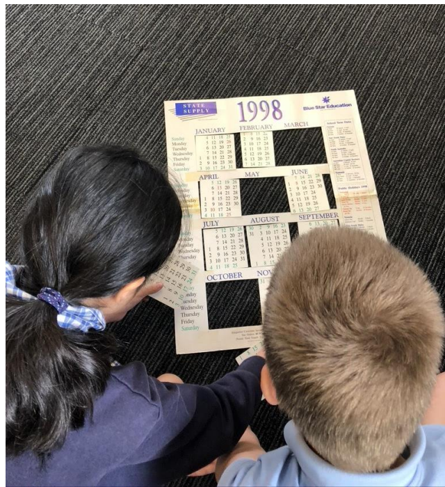
Year 5/6: Learning about calendars.