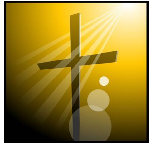
The Gospel of the Lord

'Are you the king of the Jews?' Pilate asked. Jesus replied, 'Do you ask this of your own accord, or have others spoken to you about me?' Pilate answered, 'Am I a Jew? It is your own people and the chief priests who have handed you over to me: what have you done?' Jesus replied, 'Mine is not a kingdom of this world; if my kingdom were of this world, my men would have fought to prevent my being surrendered to the Jews. But my kingdom is not of this kind.' 'So you are a king then?' said Pilate. 'It is you who say it' answered Jesus. 'Yes, I am a king. I was born for this, I came into the world for this: to bear witness to the truth; and all who are on the side of truth listen to my voice.'